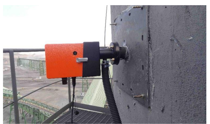
Figure 1. Air pollutant online monitoring equipment in Golgohar mining & Industrial Co.